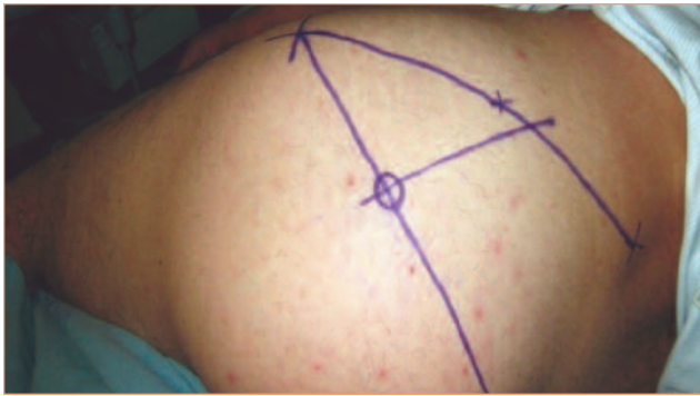
Figure 1. Landmarks for Sciatic Nerve Block: Classic LeBat Approach

motor strength and no sensation was noted along the femoral and sciatic nerve distributions in the FSB group and along the femoral nerve distribution in the FNB group. If sensory or motor blockade changes had not occurred within 30 minutes following block placement, the block was determined to be a failure.