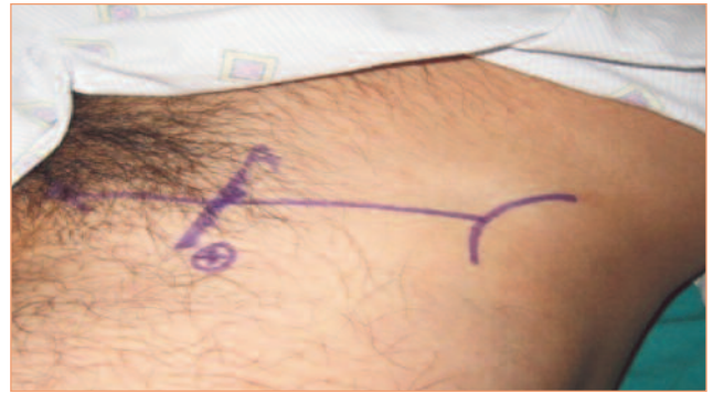
Figure 2. Landmarks for Femoral Nerve Block: Classic Approach

The times of entry to and discharge from the PACU were recorded on a data collection sheet. All subjects had PACU orders written for nausea and for breakthrough pain. Nausea was treated with ondansetron, 4 mg IV, every 15 minutes up to a total of 8 mg, and pain was treated with morphine sulfate, 1 to 3 mg IV, every 5 minutes up to a total of 0.15 mg/kg. Postoperative shivering was treated with meperidine, 12.5 to 25 mg IV, every 15 minutes up to a total of 50 mg. All medications administered were recorded, and all subjects were observed for time of return of motor and sensory function in the PACU. A 0 to 10 VNRS score for pain was assessed on every subject on entry to and discharge from the PACU and immediately before and 30 minutes following