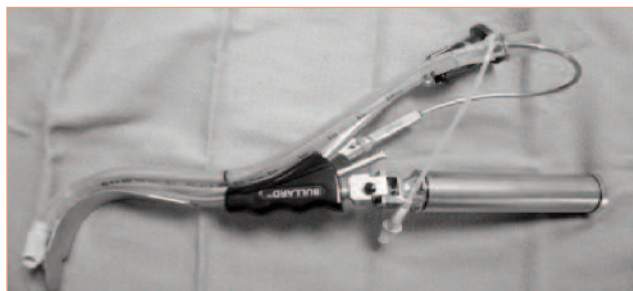
Figure 2. Flex-Tip Oral Endotracheal Tube on the Bullard Laryngoscope

The 6 patients were intubated using the Fastrach flexible tip OETT with the Bullard laryngoscope. Each intubation was visualized on the first attempt with a complete view of the vocal cords, arytenoids, and the glottic opening.